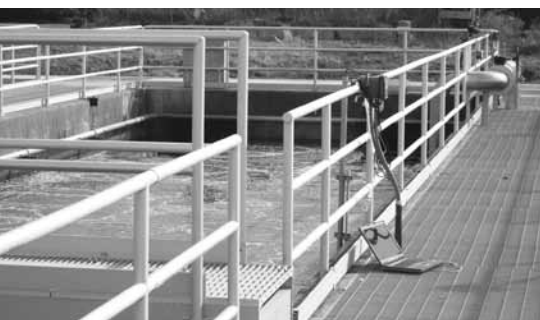
A laptop is connected to a Hach nitrogen analyzer at the Stratford, CT, wastewater treatment plant.

Nitrogen credit markets, through watershed-based nutrient trading programs, are being set up in various areas of the country. These provide a way to create a market-based incentive for plants that are proactive in the measures they take to control nitrogen output; and to provide both flexibility and a disincentive for those that don't meet their permitted levels of