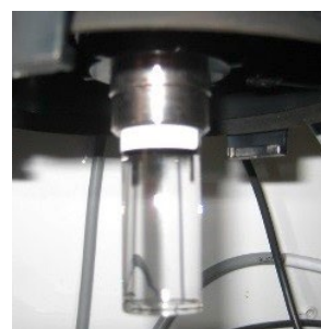
Figure 3 – photo of the vial after completion of 109 days of testing with fiber wiper. The vial looked completely clean after the test. Several additional vial checks were conducted during the test and the cleanliness was very consistent. In fact, the vial, which was installed on this instrument in October 2016, was working significantly longer in this application with ACM.